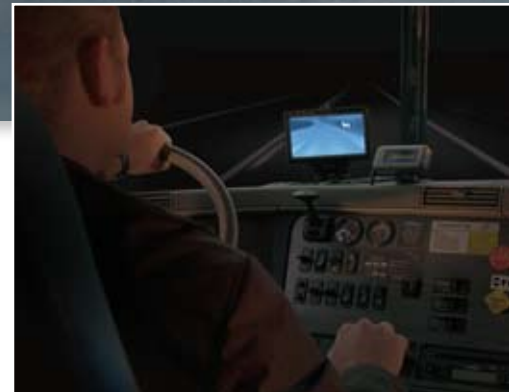
A monitor displaying the images of the PathFindIR, can be easily displayed on the dashboard. It quickly becomes a natural checkpoint for the driver similar to side view or rearview mirrors.