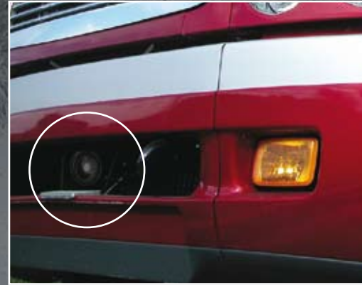
The PathFindIR installed behind the grill of a truck.