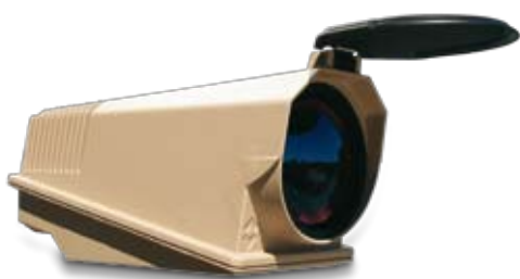
The HRC-S is an example of a thermal imaging camera with cooled Indium Antimonide (InSb) detector.