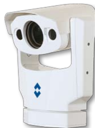
PTZ-35x140 MS: a thermal imaging camera with two uncooled micro bolometer detectors for mid to long-range surveillance.

Generally speaking, the images from MWIR cameras pointed at nighttime scenes of interest show quite vivid contrast compared