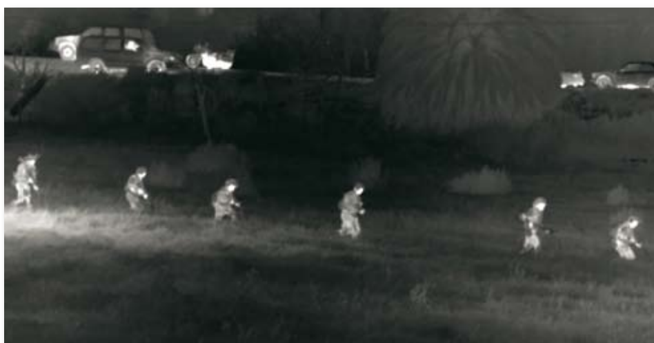
Long-range surveillance in total darkness is a perfect application for thermal imaging technology

Changes in scene temperature cause changes in the bolometer temperature which are converted to electrical signals and processed into an image. Uncooled sensors are designed to work in the Longwave infrared or LWIR band from 7 to 14 microns in wavelength, where terrestrial temperature targets emit most of their infrared energy.