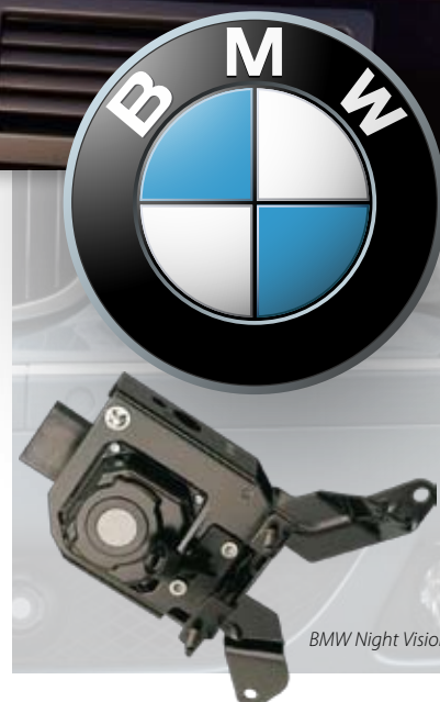
BMW Night Vision module

The reasons are obvious: poor or significantly limited sight conditions on highways and country roads, obstacles or narrow bends which are recognised too late with the low beam, inappropriate judgement of speed or distance due to a lack of orientation for the eye, driving into the "black hole" of the headlights of oncoming traffic, possibly exacerbated by wet, reflecting road surfaces – just to mention a few examples.